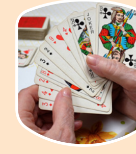
Friendly Game Competitions