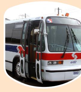
Public Transportation at our Front Door