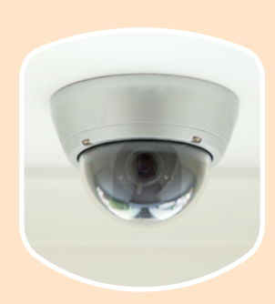
Safe and Secure Environment