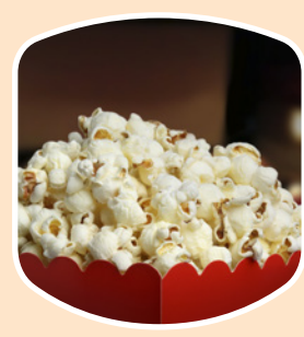
Social Hour and Movie Nights